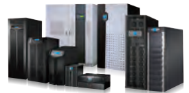
Delta offers full range UPS solutions from 600 VA to 4000 kVA to fulfill your power security needs.